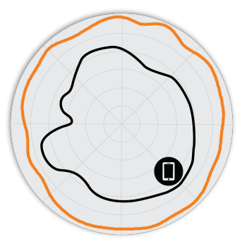
Figure 3. R650 5GHz Azimuth Antenna Patterns