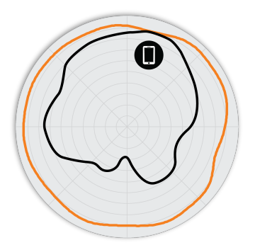
Figure 2. R650 2.4GHz Azimuth Antenna Patterns